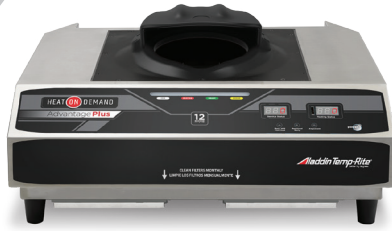
Advantage Plus ADV700E

HEAT ON DEMAND IS YOUR MEAL DELIVERY SOLUTION