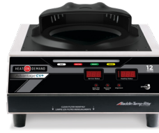
Advantage CV+ ADV600E