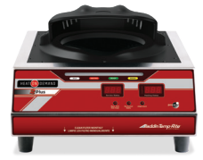
2 Plus HOD250